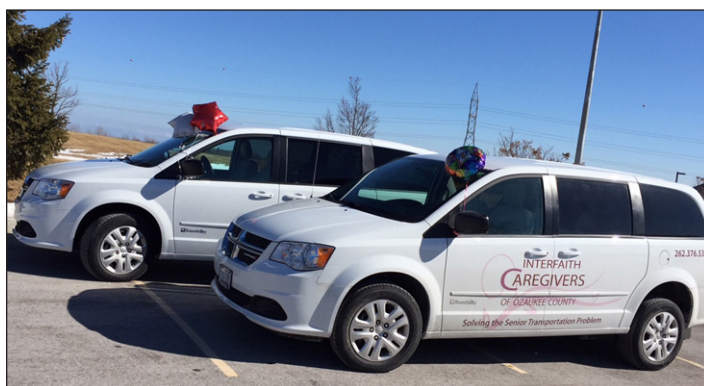
Interfaith Ozaukee's second van has arrived, allowing volunteers to transport more clients who use wheelchairs.

on Chrysler/Dodge minivan platforms and both have a ramp that opens to the back of the vehicle.