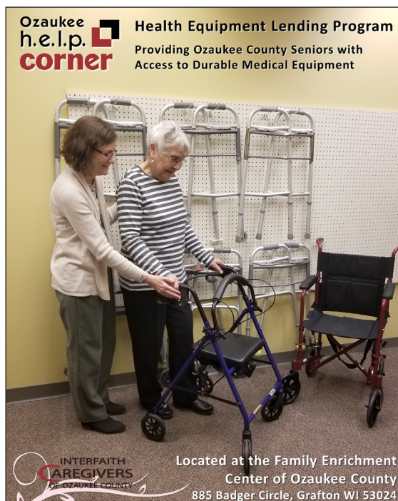
Ozaukee h.e.i.p. Corner lends equipment to those in need.