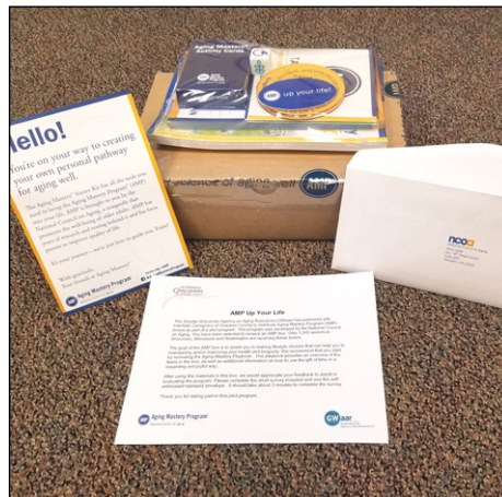
Thirty ICO clients will receive AMP kits.

The kit includes an Aging Mastery Playbook, a daily checklist, a deck of affirma-