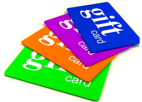
Sign up a volunteer, get a gift card!

This demographic shift means more area residents are in need of Interfaith Ozaukee's services, such as transportation to doctor and therapy appointments and trips