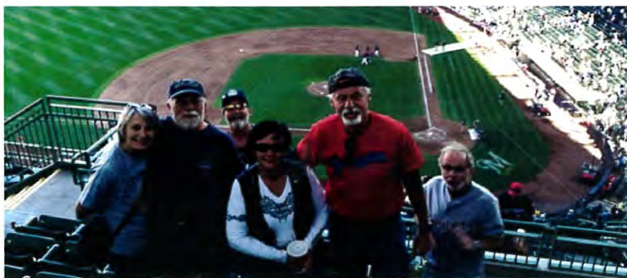
Interfaith volunteers enjoyed a Brewers game care of WE Energies this summer.